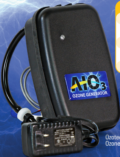
Ozotech EOG Ozone Generator